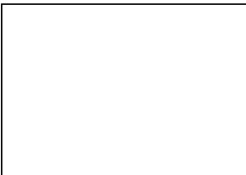
2026 - MSA STAMP