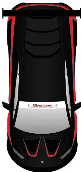
Windscreen Sticker x1

Apply to Corners: Affix one sticker to each corner of your vehicle, adhering to a consistent height for uniformity.